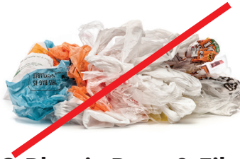
NO Plastic Bags & Film (Find a recycling site at plasticfilmrecycling.org .)