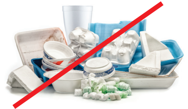
NO Foam Cups & Containers (Check Earth911.org for options.)