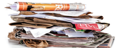
Paper Brown paper bags, non confidential office paper, newspaper, magazines