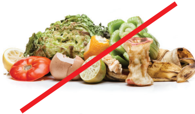
NO Food Waste (Compost instead!)

Things you can do to ensure quality material is recycled: