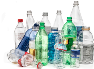
Plastic Bottles, Jars & Jugs (narrow neck containers labeled #1 and #2)