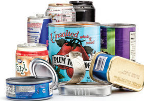
Food & Beverage Cans Steel, tin & aluminum soda, vegetable, fruit & tuna cans