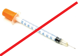
NO Needs (Keep medical waste out of recycling. Place in safe disposal containers like Waste Management's MedWaste Tracker ® box.)