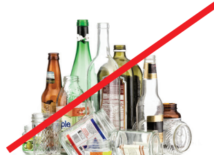
NO Glass Bottles & Containers